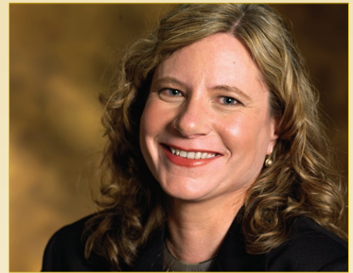
SCIENCE POLICY DIRECTOR

For over 25 years, Fresh Energy has focused on developing science-based, data-driven climate and energy policies that create opportunities for all people to thrive from clean energy solutions. We tell our members and friends: Identify your highest lever of influence on climate policy and we will help you pull that lever with all your strength. I prize the many passionate, smart Minnesotans whose work has made our state a leader in the clean energy economy.